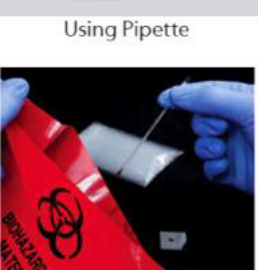
Proper GLP<sup>1</sup> disposal of pipette <sup>1</sup>GLP = Good Laboratory Practice